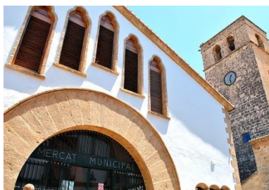
Jávea's Historic City Center