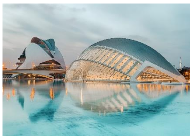
City of Arts and Science