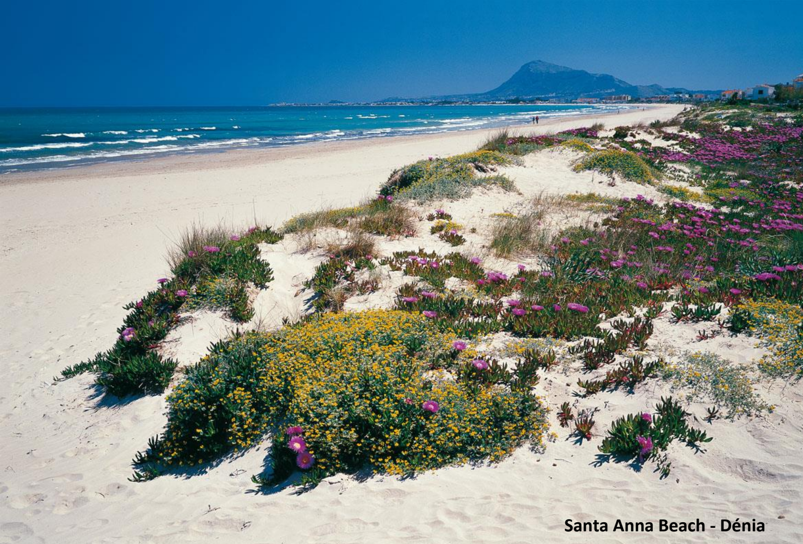
Santa Anna Beach - Dénia