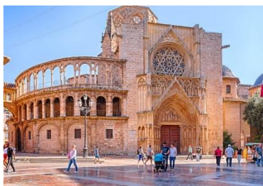
Valencia's Historic City Center