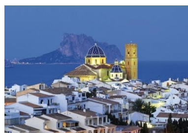
Altea's City Center