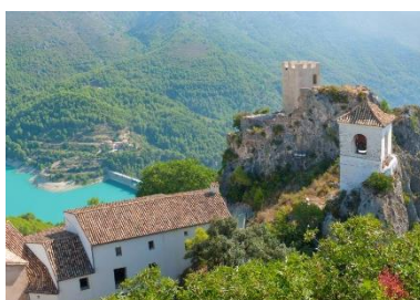
Castell de Guadalest