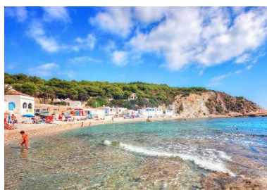
Cala Portitxol in Jávea