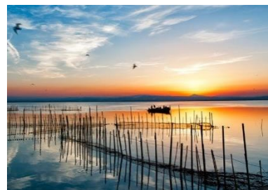
Albufera de Valencia