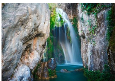
Las fuentes del Algar