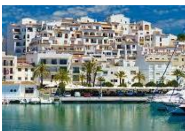
Moraira's City Center