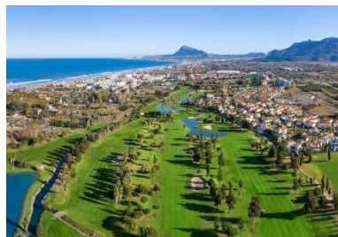
Oliva Nova Golf Resort