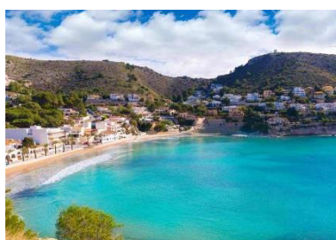
Cala El Portet in Moraira