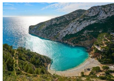
Cala de la Granadella in Jávea