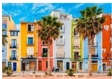
Villajoyosa's City Center